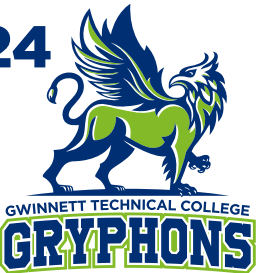
Introduced a new mascot